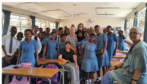
Figure 12. Visiting Centenary secondary school in Durban

It is without doubt, that a conference was successful. Good discussions, presentations, seminars are useful not only in a professional or scientific sense, but first of all in a sense of exchanging experience and communication. Practical conference aspect is also important. The participants of the conference actively participated in various workshop sessions,