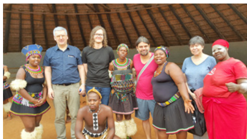
Figure 11. Cultural visit – Phezulu village – Zulu dancers

Some of the conference participants from other countries visited Centenary secondary school. It was interesting and useful to meet with the school students, teachers, and also with the school administrators. Though, it was quite a short visit, however, the visitors managed to feel everyday life of a school, to discuss about school achievements and problems. It is always sensible to get acquainted just a little with the other country's education system at a real time and real place. Everybody was fascinated by the students' curiosity, high learning motivation, willingness to find out information. Teachers also encounter various challenges, e.g., work in a multicultural environment, varied and multiple student and their family experiences and so on. All this requires flexibility, high proficiency.