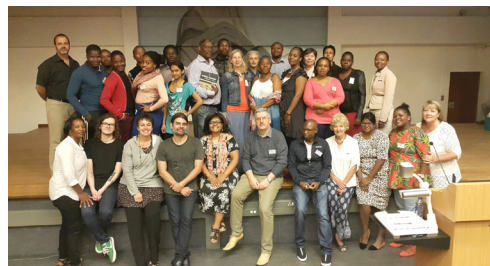
Figure 8. Conference participants

The fieldtrip on the last afternoon was to the Mariannhill landfill, which is recognised as a conservancy. It is a sustainable, eco-friendly engineered “closed-loop” design and includes the treatment and re-use of landfill emissions. This is the first landfill conservancy in Africa and the world.