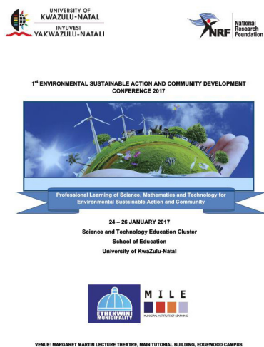
Figure 5. Conference programme and book of abstracts cover page