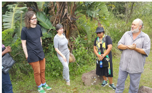
Figure 10. Landfill site - walk

A visit to Durban is incomplete if PheZulu Safari park and a local school visit is not part of the itinerary. The province of KwaZulu-Natal is mainly populated by the indigenous people – the Zulu people. The Zulu culture is fascinating and you can learn so much about it from the tour and the Zulu dancers. A tour of the thatched huts where the various artifacts, beliefs and rituals of the people is explained. The Zulu dancers are adorned in their cultural dress and their rhythmic dances are linked to typical events – coming of age, courting, and marriage - is informative and entertaining. A trip through the Game Park where giraffe, zebra, kudu, buck and other animals are freely walking around is a once in a life-time experience, especially for foreigners who have never seen these animals in the wild.