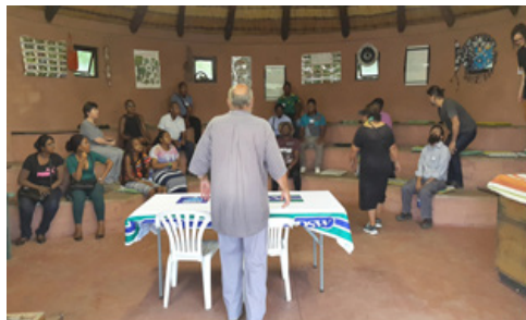
Figure 9. Landfill Site - Talk