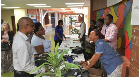
Figure 1. Conference registration