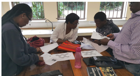
Figure 7. During a workshop (producing fullerene models by hands)

The workshop sessions included – Raising Green voices (making videos) – to empower people to express themselves in different social media; Where is the blue Helgoland lobster – a simulation game and developing science literacy – producing a fullerene model. The poetry, drama and visual formats were excellent in presenting environmental sustainability issues in a relevant, artistic and entertaining manner. As an education conference the integration of varied presentations other than presentation formations of papers enhanced the engagement of all participants.